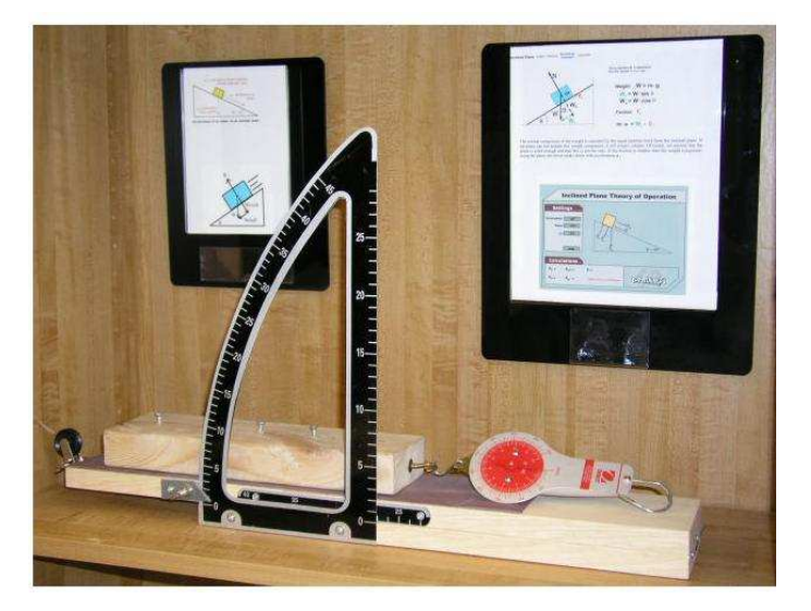
Apparatus and Set-up for Measuring F<sub>k</sub>

B. Prepare graphs of your Fk (pulling force) versus FN (normal force) data acquired in each kinetic friction experimental situation. The graph should present your data acquired from sliding the friction block along the side with the greatest contact area. Pulling forces required to overcome kinetic (sliding) friction and maintain a constant rate of motion are to be plotted only . Organize your graphs so that pulling force (F<sub>P</sub>, which also incidentally equals Fk in magnitude) appears on the ordinate and FN (which also incidentally equals weight in magnitude) appears on the abscissa. How do the slopes of your graphed lines compare with one another? What does the slope of each line reveal about the relationship between mass, pulling force, and frictional force? To which numerical value that we have previously analyzed is the slope equal? Explain.