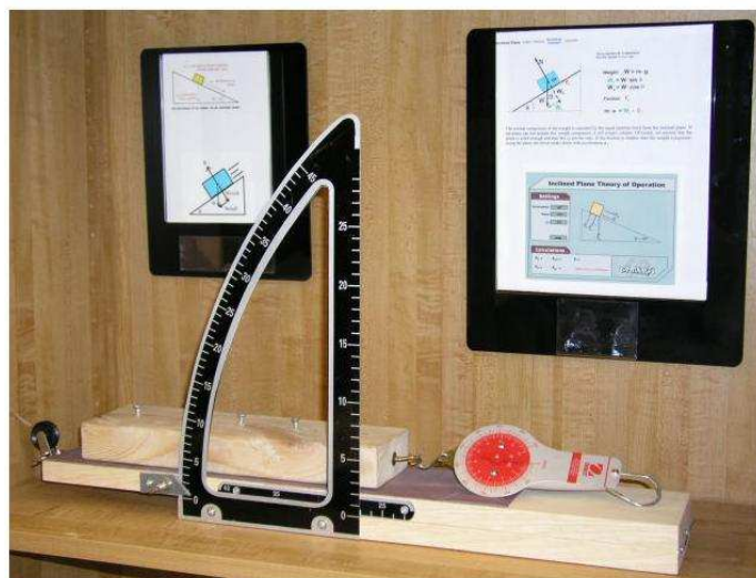
Apparatus and Set-up for Measuring F_k

B. Prepare graphs of your F_k (pulling force) versus F_N (normal force) data acquired in each kinetic friction experimental situation. The graph should present your data acquired from sliding the friction block along the side with the greatest contact area. Pulling forces required to overcome kinetic (sliding) friction and maintain a constant rate of motion are to be plotted only . Organize your graphs so that pulling force ( F_p , which also incidentally equals F_k in magnitude) appears on the ordinate and F_N (which also incidentally equals weight in magnitude) appears on the abscissa. How do the slopes of your graphed lines compare with one another? What does the slope of each line reveal about the relationship between mass, pulling force, and frictional force? To which numerical value that we have previously analyzed is the slope equal? Explain.